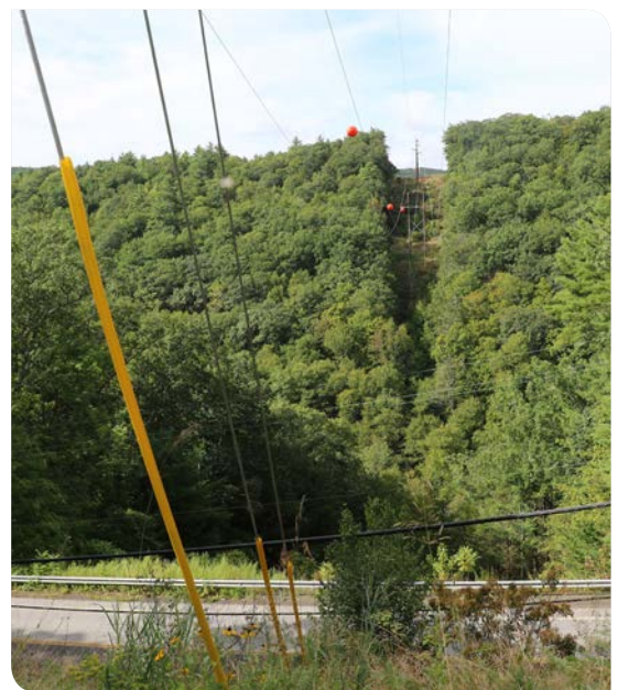
Towers supporting CHG&E's transmission lines utilize Avlite's A-0 Obstruction Light Kits.

Central Hudson's electric transmission system of 600 pole miles of line. It also has an electric distribution system of 7,200 pole miles of overhead lines to serve its residential, commercial and industrial customers. Infrastructure replacement initiatives identified a critical safety area that needed attention: obstruction lighting on some transmission and distribution towers was unreliable, intermittently operated, and required ongoing maintenance. Access to the effected transmission and distribution towers was difficult due to the 4,000-foot peaks of the nearby Catskill Mountains.